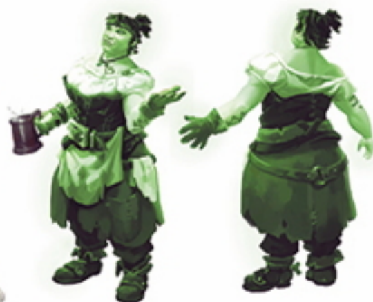
Tavern owner ghost