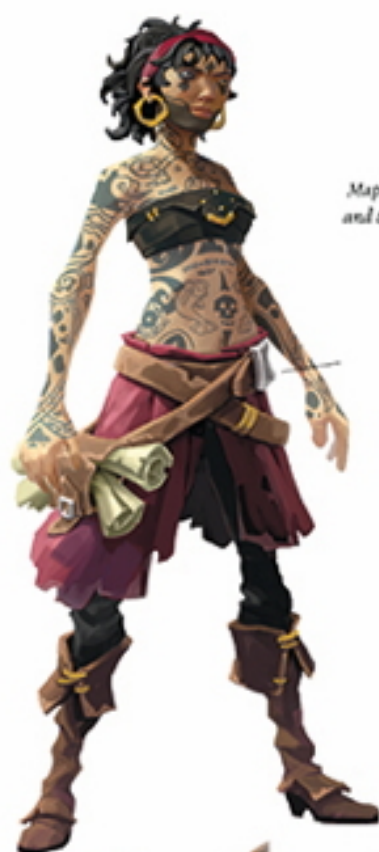
Map seller and tattoos