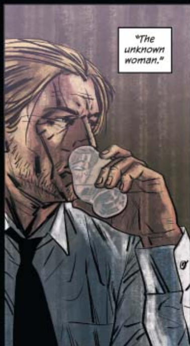
"The unknown woman."