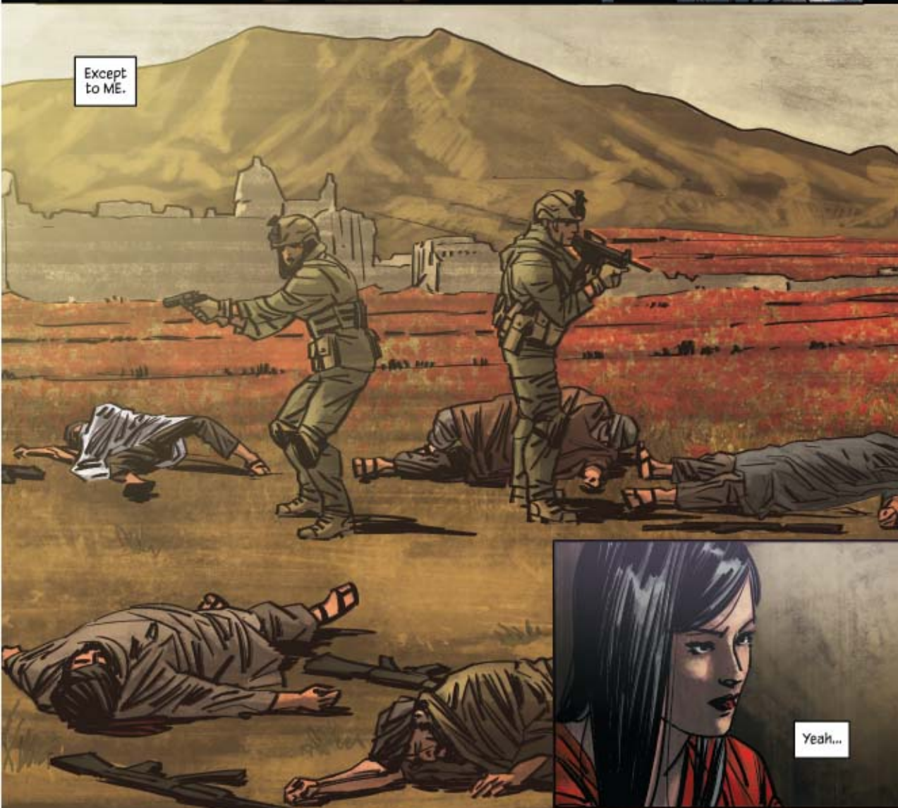
Except to ME.