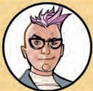
KID OMEGA QUENTIN QUIRE