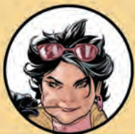
JUBILEE JUBILATION LEE