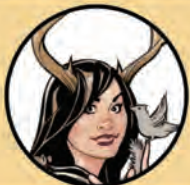
NATURE GIRL LIN LI