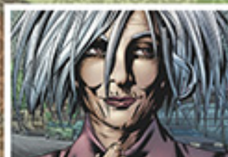
SLOTH BEATRICE A.K.A. SENECA.