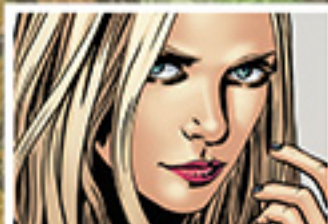
LUST SOPHIA A.K.A. PULCHRA.