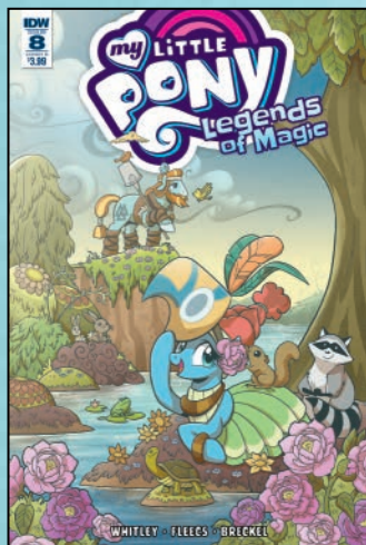
SUBSCRIPTION COVER art by Brenda Hickey