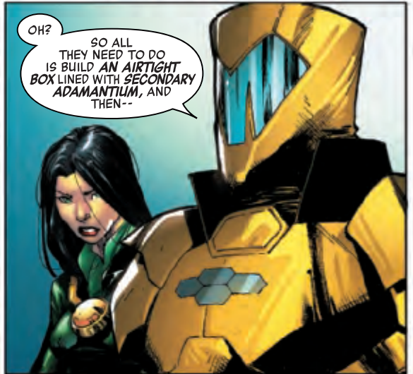
MONICA RAPPACCINI AND ANDREW FORSON. Ex-A.I.M. Leaders. Not in mourning.

OH? SO ALL THEY NEED TO DO IS BUILD AN AIRTIGHT BOX LINED WITH SECONDARY ADAMANTIUM, AND THEN--