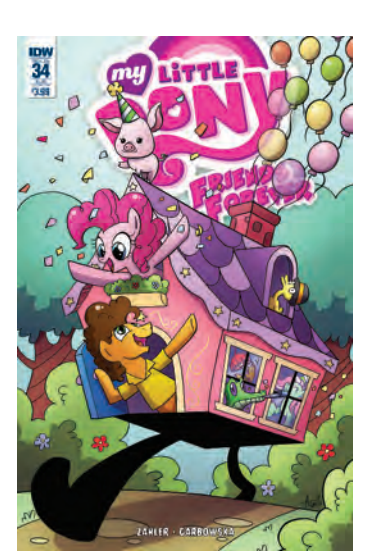
SUBSCRIPTION COVER art by Agnes Garbowska