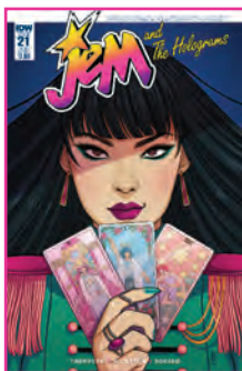
SUBSCRIPTION COVER ART BY JEN BARTEL