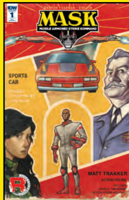
INCENTIVE COVER Art by Sonny Liew