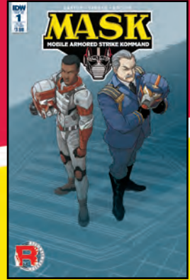
SUBSCRIPTION COVER Art by Joe Sutor