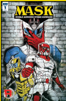
INCENTIVE COVER Art by Sara Pitre-Durocher