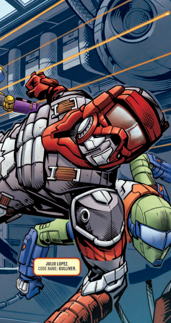
JULIO LOPEZ. CODE NAME: GULLIVER.