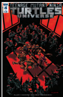
SUBSCRIPTION COVER A ART BY DAMIAN COUCEIRO