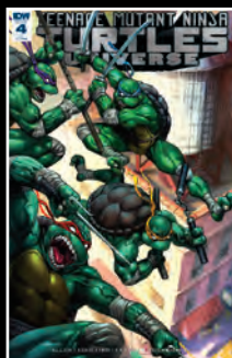
INCENTIVE COVER ART BY AGUSTIN GRAHAM NAKAMURA