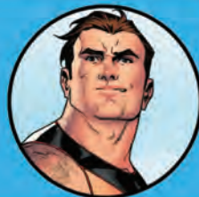
BEAST HANK McCOY