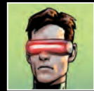
CYCLOPS Scott Summers

Not long ago, the Avengers invited three younger heroes to join their ranks: Ms. Marvel, Nova and Miles Morales. But in the wake of the second super hero civil war, the teenage Avengers became disillusioned with the team. They broke off to form the Champions, a group of young heroes determined to find a better way to change the world.