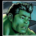
THE HULK Amadeus Cho