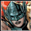
THOR Jane Foster