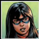
MS. MARVEL Kamala Khan