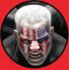
OLD MAN LOGAN