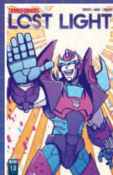
RETAILER INCENTIVE COVER