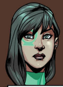
GREEN LANTERN (JESSICA CRUZ)