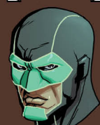
GREEN LANTERN (SIMON BAZ)