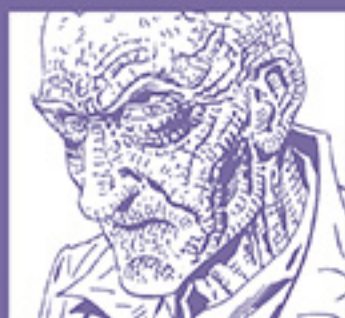
THE OLD MAN Gangster. Weary. Deceased.