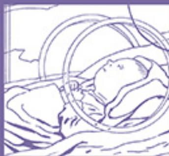
NEW BABY Name unknown. Of questionable lineage.