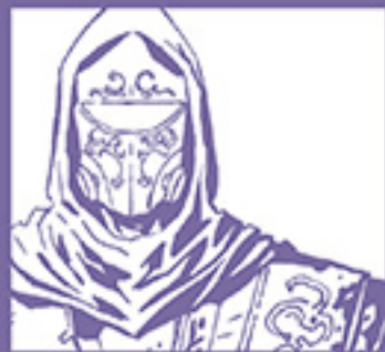
MAGHAZO Terror herald. The right hand of doom.