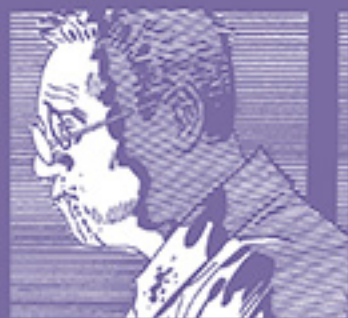
ALBERT EISENHOWER Operator. Intel nexus. Toothless.