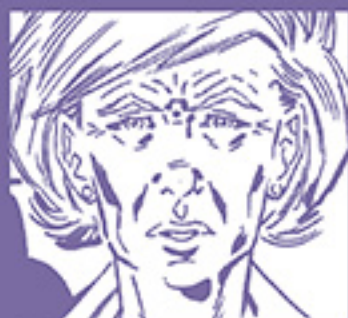
QUINN Mentor. Puppet master. Deceased.