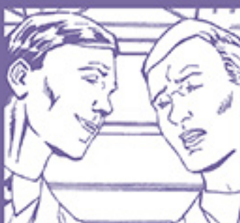
THE ALPHA BROS. Cha Cha & Dolph. Criminal. Ambiguous.