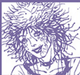
THE BONE COLLECTOR Seductive. Strange. Saturn's Most Wanted.