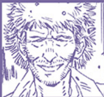
THE PRANK ADDICT Remnant. Hospitalized. Faking amnesia.