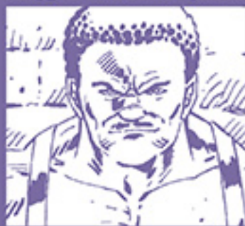
SKYSCRAPER Break muscle. Big. Befuddled.