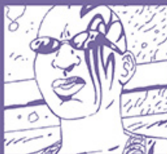
MASAI Break. Boss. Bad ass.