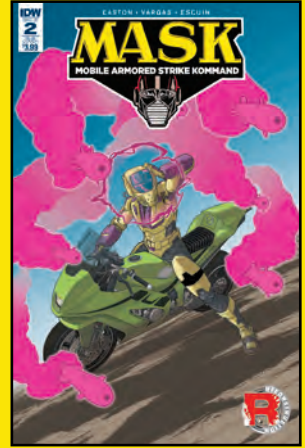
SUBSCRIPTION COVER Art by Joe Suiitor