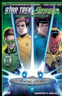
NERD BLOCK EXCLUSIVE COVER art by Angel Hernandez colors by Esther Sanz