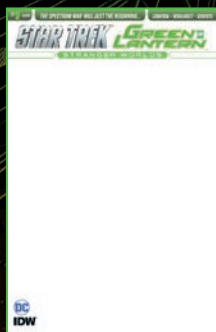
BLANK SKETCH COVER