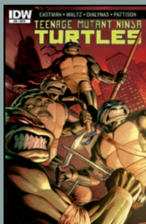
Retailer Incentive Cover Art by Atilio Rojo