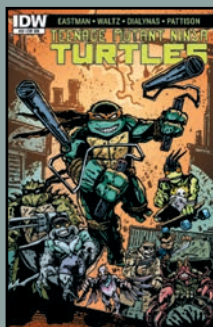
Subscription Cover Art by Kevin Eastman Colors by Ronda Pattison