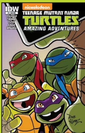
Subscription Cover Art by Dave Alvarez