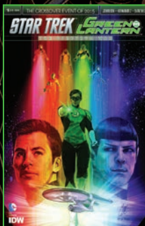
SUBSCRIPTION COVER A art by Cat Staggs after Bob Peck