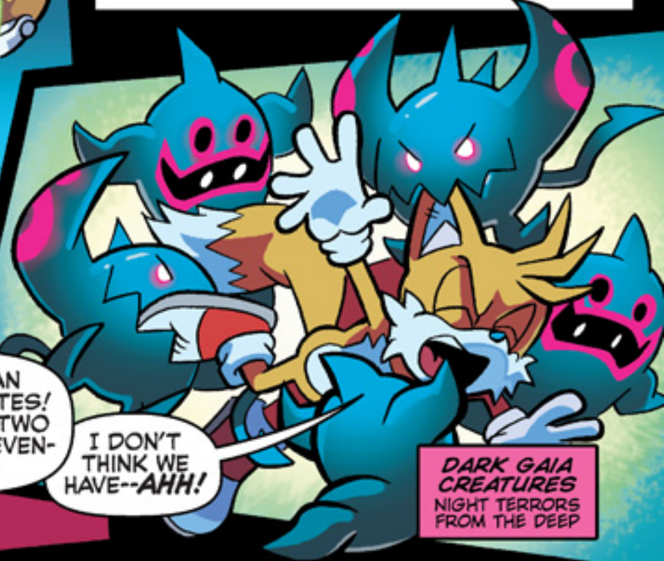
DARK GAIA CREATURES NIGHT TERRORS FROM THE DEEP