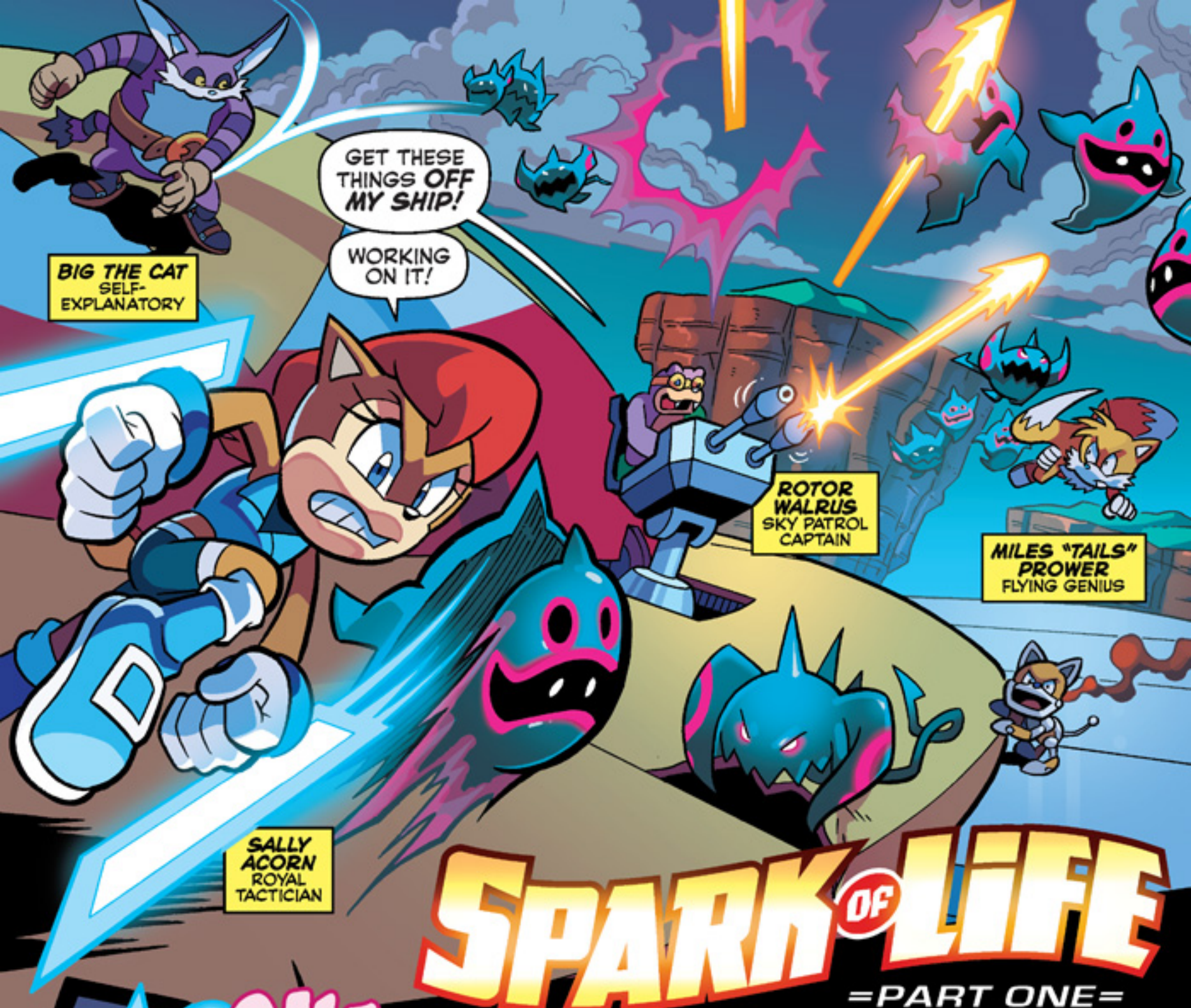
BIG THE CAT SELF-EXPLANATORY