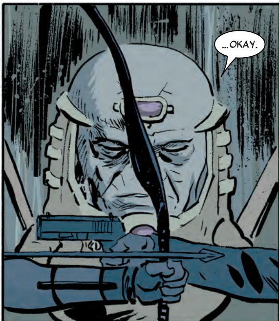
PHIL COULSON. Secret Avenger. Tried to run from Secret Avengers. Now wants resolution.