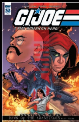
Retailer Incentive Cover