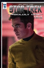
Retailer Incentive Photo Cover A