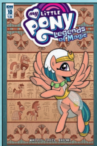
SUBSCRIPTION COVER art by Brenda Hickey