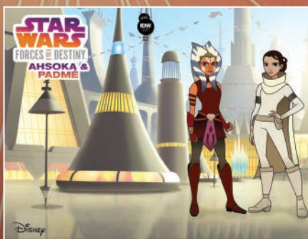
COVER RI-A Animation Art