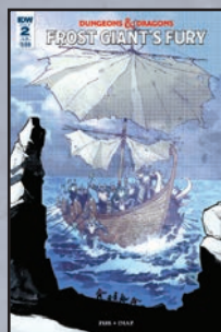
SUBSCRIPTION COVER art by Nelson Daniél