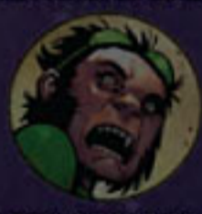
MOON BOY, AGENT OF HYDRA