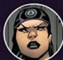
BULLSEYE (ELEKTRA NATCHIOS)