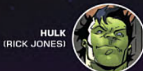
HULK (RICK JONES)