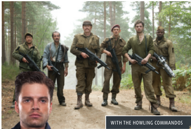
WITH THE HOWLING COMMANDOS