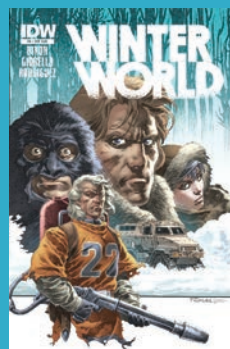
SUBSCRIPTION COVER ART BY TOMAS GIORELLO COLORS BY DIEGO RODRIGUEZ