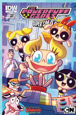
SUBSCRIPTION COVER art by Paulina Ganucheau