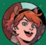
DOREEN GREEN, A.K.A. THE UNBEATABLE SQUIRREL GIRL!