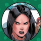
DAISY JOHNSON, A.K.A. THE EARTH-SHATTERING QUAKE!