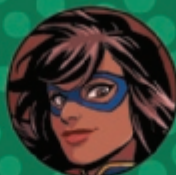
KAMALA KHAN, A.K.A. THE MAGNIFICENT MS. MARVEL!