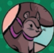
TIPPY-TOE, THE SQUIRREL WHO NEEDS NO OTHER NAME!