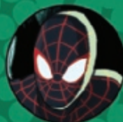
MILES MORALES, A.K.A. THE SPECTACULAR SPIDER-MAN!