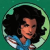
AMERICA CHAVEZ, A.K.A. THE BADDEST CHICK YOU KNOW!