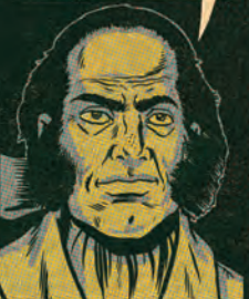
SEBASTIAN SHAW, BLACK KING