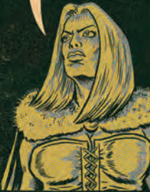
EMMA FROST, WHITE QUEEN

YOUR "EXPERTISE" FAILED! THESE ARE NOT THE X-MEN!