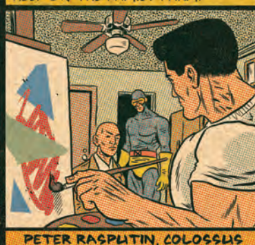
PETER RASPUTIN, COLOSSUS

RUSSIA. THE IMMENSE STRENGTH OF HIS METALLIC FORM IS A BIG HELP ON THE FAMILY FARM.