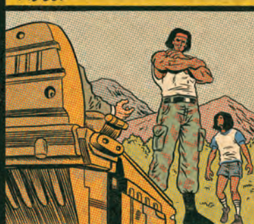
JOHN PROUDSTAR, THUNDERBIRD

USA. STRONG AS AN OX. FAST AS A HORSE. STUBBORN AS A MULE.