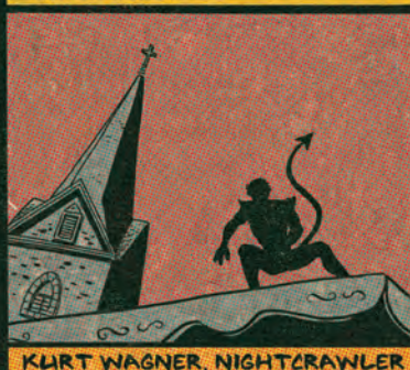
KURT WAGNER, NIGHTCRAWLER

GERMANY. THE CIRCUS ACROBAT WAS HARD TO PIN DOWN. TELEPORTATION IS HIS SAFETY MECHANISM.