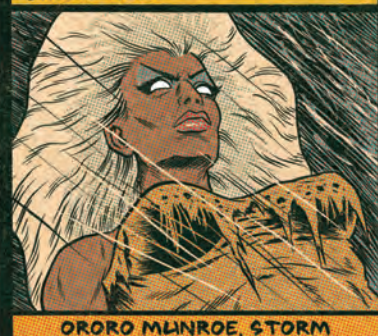
ORORO MUNROE, STORM

AFRICA. SHE BROUGHT CROP-BEARING RAINS TO HER NEIGHBORS. THEY WORSHIP HER LIKE A GOD.