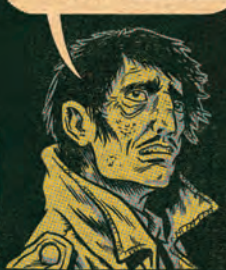
MASTERMIND, PROBATIONARY ALLY

I--I DON'T UNDERSTAND. I SPENT SOME TIME IN THAT HOUSE BEFORE.