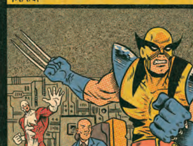
WEAPON X, WOLVERINE

CANADA. HE'S THE CROWN JEWEL OF THEIR MILITARY BUDGET. A CANTANKEROUS, NEARLY INDESTRUCTIBLE LITTLE MAN.