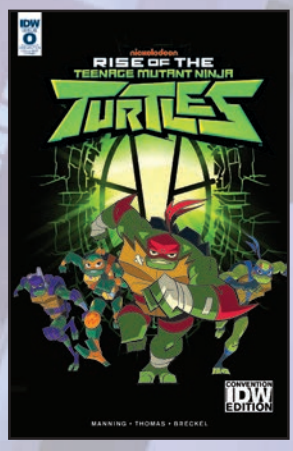
IDW CONVENTION EXCLUSIVE