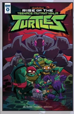
RI COVER ART BY ANDY SURIANO