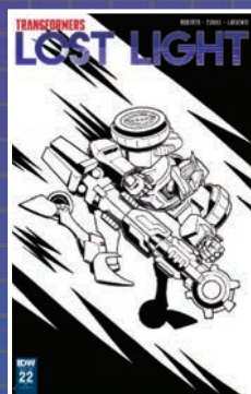
RETAILER INCENTIVE COVER