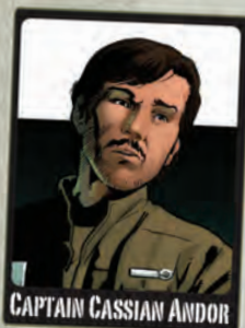
CAPTAIN CASSIAN ANDOR