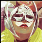
THOR Jane Foster