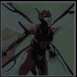
WASP Nadia Pym