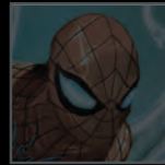
SPIDER-MAN Peter Parker