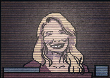
Meanwhile, questions continue to rise about ties to the European criminal underworld...