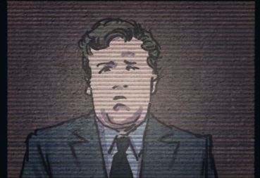
As this White House seems intent on destroying funding to health care with no intent of renewal...