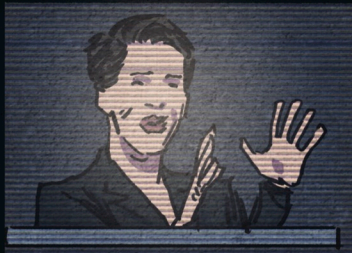
As a suspected mob boss is appointed to head the Department of Justice.