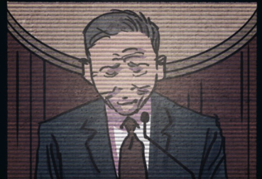
And money laundering charges are dropped in exchange for loyalty pledges.