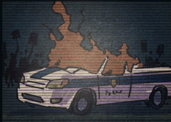
As North Korea has announced a bilateral nuclear arms deal with ISIS...