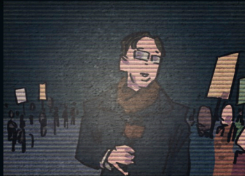
Let's call it "alternative legislation." Legislation by decimation...