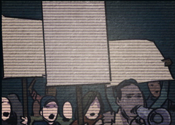
Tens of thousands of protestors around this country have been arrested...