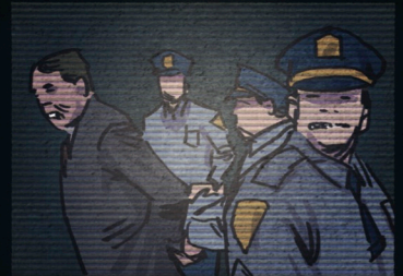
The definition of "illegals" has been expanded to those whose parents refuse to pledge allegiance to this President...