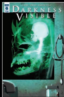
REGULAR COVER ART BY LIVIO RAMONDELLI