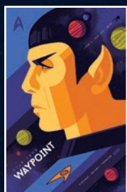
Subscription Cover Art by Tom Whalen