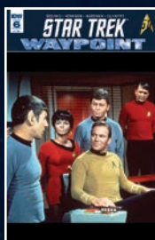
Retailer Incentive Photo Cover