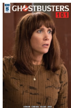
RETAILER INCENTIVE WRAPAROUND PHOTO COVER