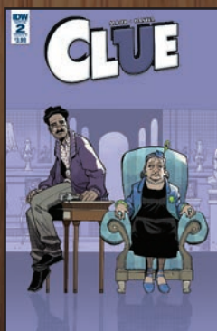
COVER B ART BY NELSON DANIEL