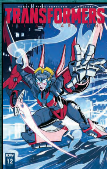
RETAILER INCENTIVE COVER