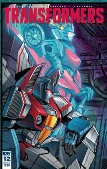
COVER B Artwork by: PRISCILLA TRAMONTANO