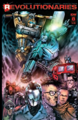
COVER C Art by Santipérez Colors by Jay Fotos