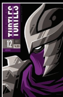
COVER B ART BY TOM WHALEN