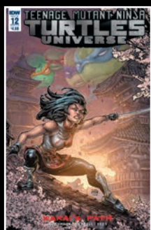
COVER A ART BY FREDDIE E. WILLIAMS II