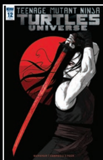
INCENTIVE COVER ART BY SOPHIE CAMPBELL