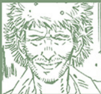
PRANK ADDICT Remnant. Hospitalized. Faking amnesia.