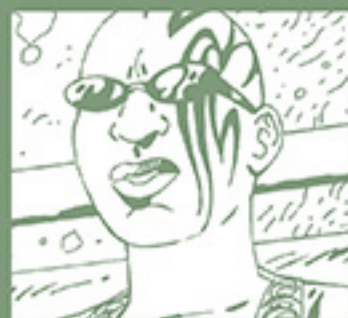
MASAI Break. Boss. Bad ass.