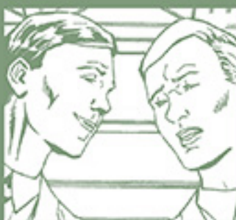
THE ALPHA BROS. Cha Cha & Dolph. Criminal. Ambiguous.