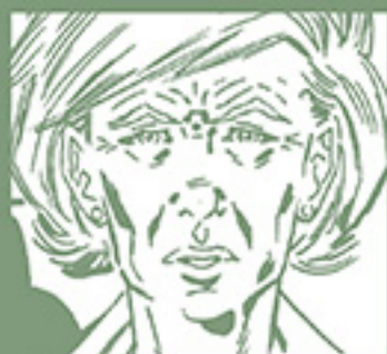
QUINN Mentor. Puppet master. Deceased.