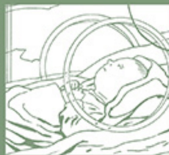
NEW BABY Name unknown. Of questionable lineage.