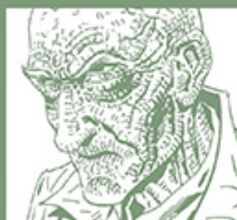
THE OLD MAN Gangster. Weary. Deceased.