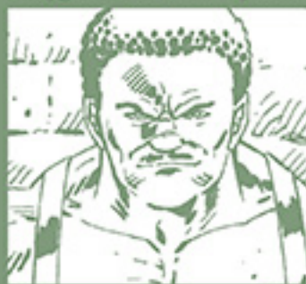
SKYSCRAPER Break muscle. Big. Befuddled.