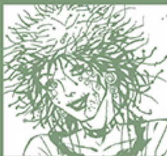
THE BONE COLLECTOR Seductive. Strange. Saturn's Most Wanted.