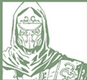
MAGHAZO Terror herald. The right hand of doom.