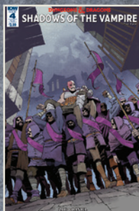
SUBSCRIPTION COVER art by Nelson Dániel