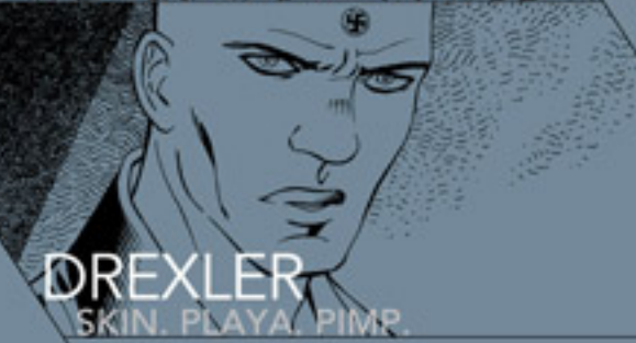
DREXLER SKIN. PLAYA. PIMP.