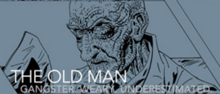
THE OLD MAN GANGSTER. WEARY. UNDERESTIMATED.