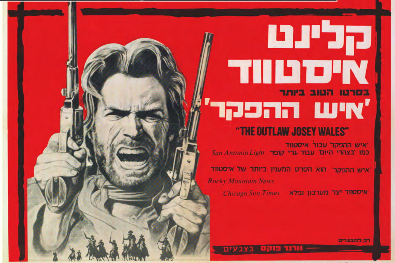
P. 134, TOP | The Outlaw Josey Wales (1976)