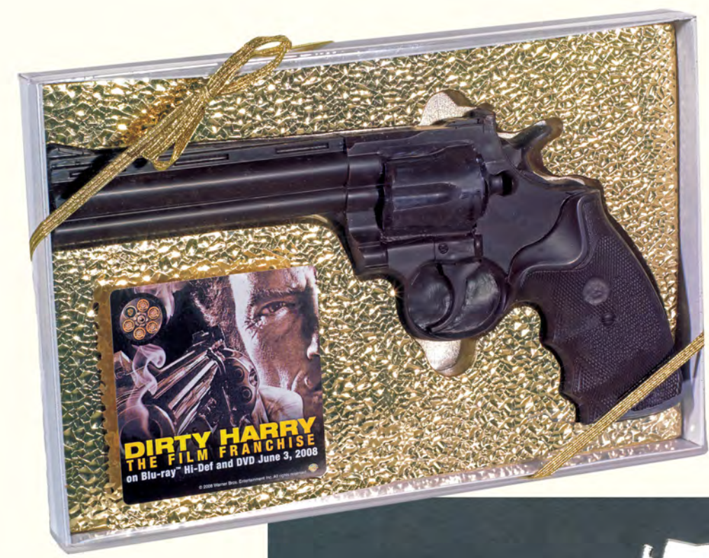
P. 97, TOP & MIDDLE | Dirty Harry (2008 U.S. restored version release) Keychain handcuffs and chocolate gun These keychain handcuffs and chocolate gun were given away at the May 2008 VIP screening of the restored version of Dirty Harry , which was organized by Warner Bros. to promote the release of the restored film on DVD and Blu-ray. P. 97, BOTTOM | Dirty Harry (1971) Ticket to the world premiere of the film This is Eastwood's ticket to the world premiere of Dirty Harry , which took place in Los Angeles on December 21, 1971. The film was officially released in the United States in New York City on the following day, and then across the country on December 23, 1971.